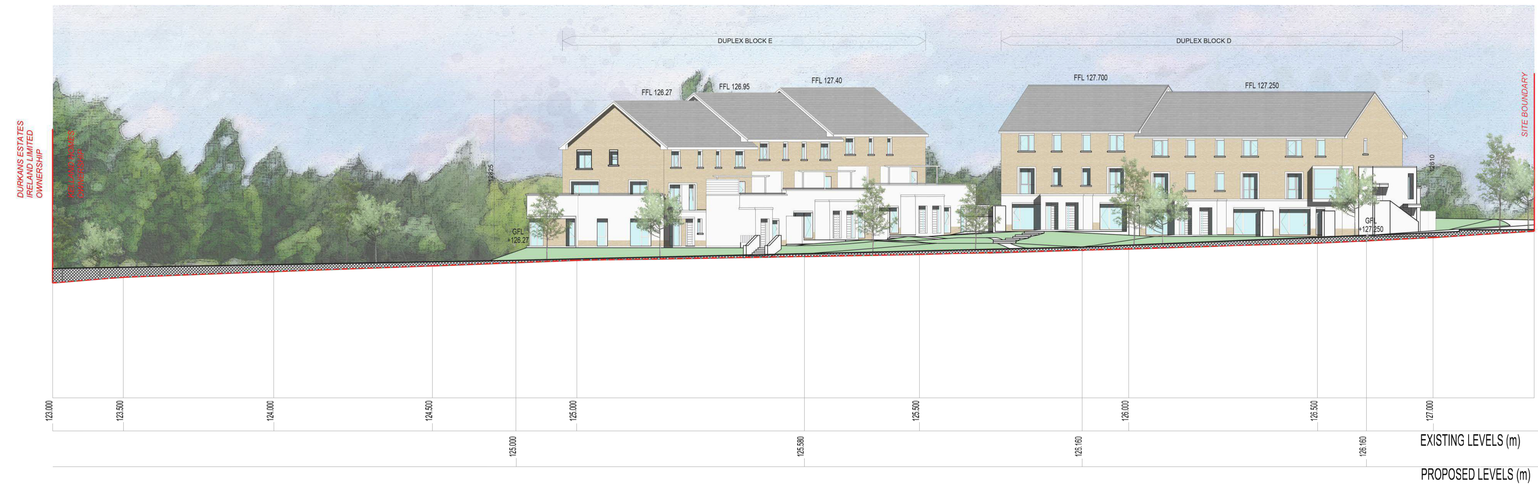
SECTION E-E - Scale 1:200